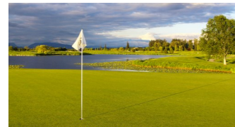
Northview Golf & Country Club (Canal Course)