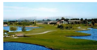
Mayfair Lakes Golf & Country Club