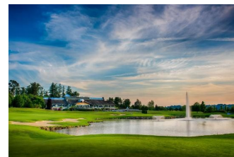
Northview Golf & Country Club (Ridge Course)